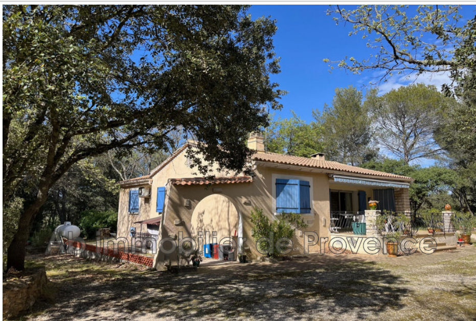
Villa 313 Rognes

Grumbles. In the countryside, not isolated. Healthy house, with basement, completely to be re-thought. Nice potential. Very beautiful land with numerous stone walls. Good exhibition. To see quickly. Contact: Armelle Buckens 06 87 1 44 0 64